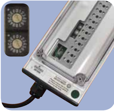
Ease of flash setting selection (where required) via internal rotary switches