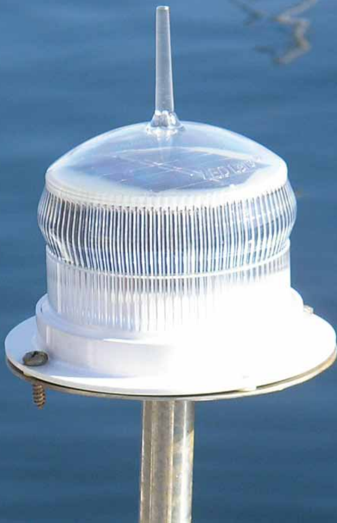
SL15 solar marine lantern Vigo, Spain

Head Office Sealite Pty Ltd 11 Industrial Drive, Somerville VIC 3912 AUSTRALIA