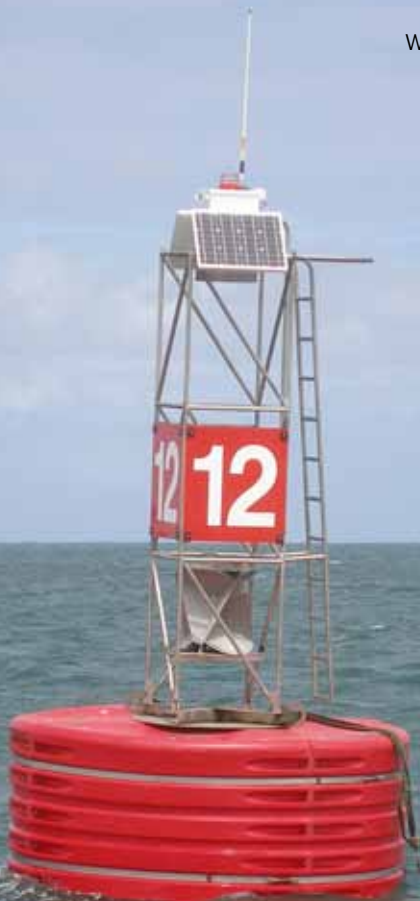
Trident buoy Westernport Bay, Australia

By choosing Sealite you can rest assured you have chosen the very best.